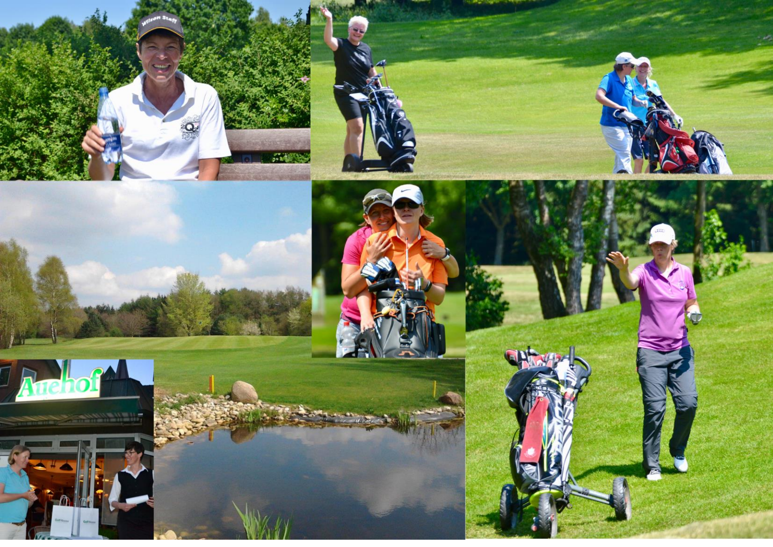
4<sup>th</sup> Rainbow LadiesCup June, 2<sup>nd</sup> – 4<sup>th</sup> 2023

At the Golfclub Hude, Lehmweg 1, 27798 Hude phone: +49 (0) 44 08- 92 90 90, www.golfinhude.de